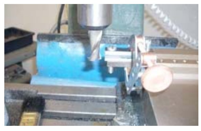
Milling Link Ends

After running a screw through the first threaded hole, I center drilled the second hole, followed by a clearance drill, and tap.