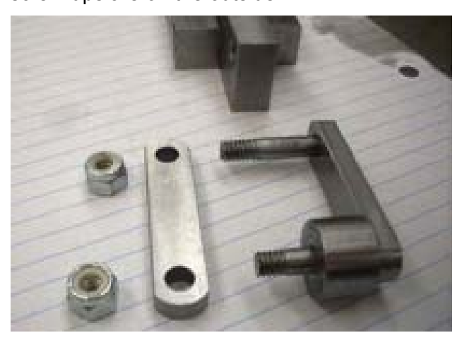
Link Parts

The results look good. Alas, my best looking parts are hidden deep inside and the screw-ups are on the outside.