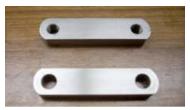
Link Results

By taking .02" cuts and having a 12" lever arm clamped to the links, I was able to freehand round the ends.