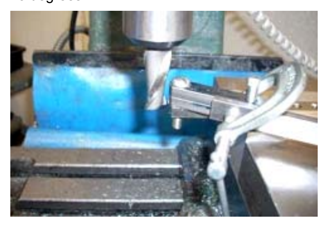
Rounding Link Ends

length and zero was set on the X axis. I then backed the cutter away such that it did not touch the corner of the link as it was swung out 45 degrees.