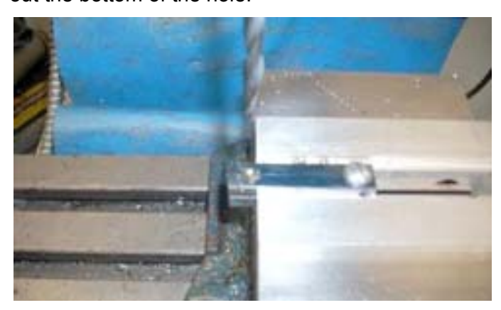
2nd Hold

I then ran the tap using the flywheel trick. It went all the way through without any fuss. I would not try this with a hand tap but the spiral point taps are designed to run under power. Chips are ejected out the bottom of the hole.