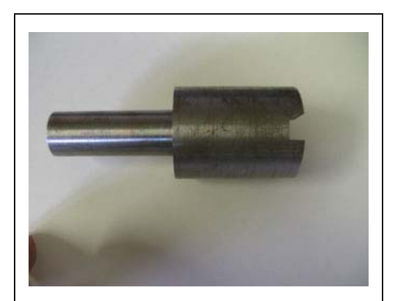
Fig. 2 Stamp Holder Profile

To stamp the numbers I made the following numeral stamp holder – for perspective the holder is 8 inch long with a \frac{3}{4} inch shaft and a 1- \frac{1}{4} inch shaft (see fig. 1 and fig. 2). The holder has