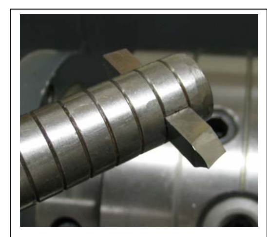
Fig. 4 HSS Graduation Cutter Bit

by PULLING the compound toward the open end of the collar – never 'push' the line, as this will result in a very deep and unsightly mark. In addition, cut the mark using the compound with the carriage locked. This way you can measure the length of each mark exactly.