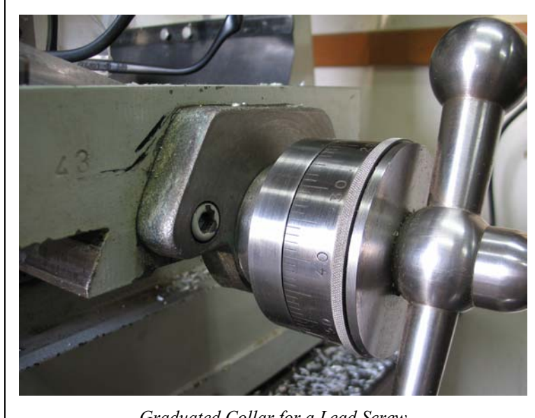
Graduated Collar for a Lead Screw

Here are some examples made with the above setup: